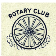
Rotary Club of Chicago emblem, circa 1906.

Ever wonder how a wheel came to represent Rotary?